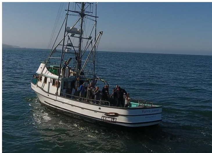
F/V Karen Jeanne on Bodega Bay Ropeless Gear Trial

Lastly, while system failures will inevitably occur in the innovation process and provide valuable lessons, the inability to locate the lost Desert Star system suggests that further gear testing include back-ups such as a traditional surface buoy and line in addition to the ropeless system. This will help retrieve gear in the event of a failure to better understand the causes of such failure, reduce the need for permits, and avoid creating marine debris. Once the kinks in the gear are worked out, the back-up line may no longer be necessary, and it is possible that widespread use of ropeless systems could eventually reduce overall rates of crab gear loss due to the absence of vertical lines while fishing.