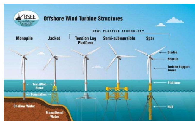
Diagram of offshore wind turbine structures. Current wind energy areas would utilize floating technology - either tension leg platform, semi-submersible, or spar.