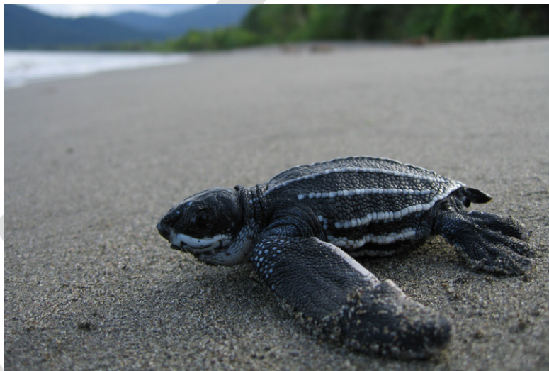
A hatching Leatherback sea turtle.

Humpback whale, Gray whale, Blue whale, and Leatherback sea turtles have been identified as key species based on CDFW and NOAA Fisheries priorities, and based on NOAA West Coast Whale Entanglement Summaries as the species most often reported as entangled in fishing gear. Therefore, key forage for these species is a high priority for improved information streams. Data on additional whale and sea turtle species’ prey may be important for further mitigation of entanglement risk.