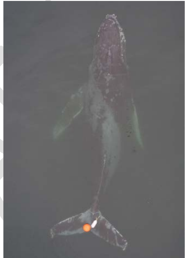
Humpback whale entangled in fishing gear. Photo: Duke University. NMFS, MMHSRP Permit 18786-03.

A variety of factors may contribute to the increase in the number of reported entanglements, including a complex relationship between the distribution, abundance and behavior of whales, environmental variability and prey distribution, and fishing effort distribution, as well as an increase in public awareness and reporting 12 . Whale species reported as entangled include Humpback whales, Gray whales, Blue whales, Fin whales, Minke whales, Sperm whales, and Orca whales. 13,14 Humpback whales have been the predominant species reported as entangled in recent years. The first confirmed Blue whale entanglement was report in 2015, with three reported in 2016, and three reported in 2017. Although there are many unknowns, multiple fisheries have been identified as having inadvertently entangled whales. 15 In 2018, there were 46 whales confirmed as entangled by NOAA off the West Coast, and seven were confirmed as dead (five Humpback whales and two Gray whales). In 2017, there were 31 whales confirmed as entangled by NOAA off the West Coast, and two of the confirmed entanglements involved Gray whales that were found dead. In 2016, there were 48 whales confirmed as entangled and the