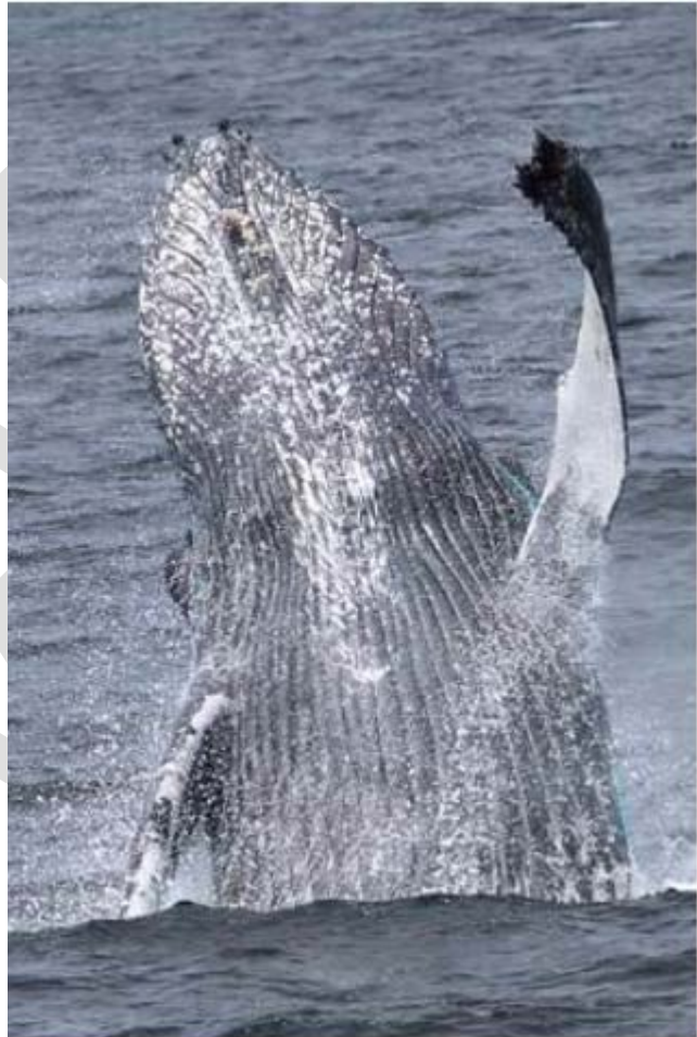
Humpback whales are frequent visitors to the California coast.

The Working Group identified improving the whale and sea turtle population densities and spatial and temporal distributions factor as a priority for assessing and mitigating risk. Additional key informational needs include verifiable data that improves understanding of whale and sea turtle movement and migration in relation to other risk factors; synthesis of available data sets to improve upon predictions of whale distributions in response to ecosystem variables; as well as whale behavior studies in the presence of fishing gear. Community science data, such as that collected by whale watching boats, may help inform population densities and distributions. The Working Group recommended synthesis of available whale watch data and comparison of this information with other whale sighting datasets to evaluate the utility of whale watch data in informing risk assessment and mitigation. 33 Improved fine-scale information on whale and sea turtle population densities and distribution can inform spatial and temporal scales of potential mitigation measures. As this data will be informative across other state-managed fisheries that may interact with whale and sea turtle species, it is important to develop this information from an annual or species-specific perspective to inform the management of fisheries other than Dungeness Crab.