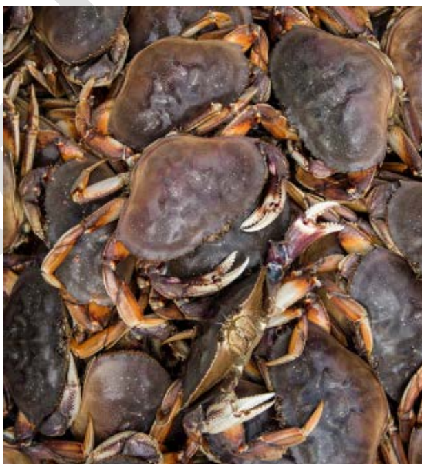
Dungeness crab are one of the top three fisheries in terms of both landings and value in California.