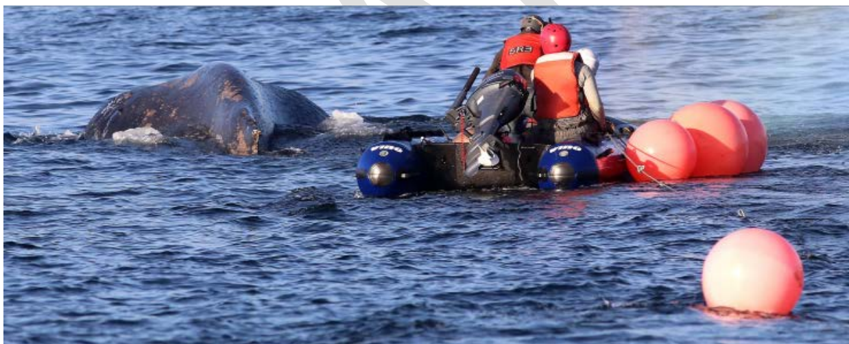
Trained disentanglement response team.

The West Coast Large Whale Entanglement responders participate in comprehensive training and apprenticeship to use appropriate techniques and abide by protocols to ensure their personal safety and the safety of the animals. In February 2019, NOAA Fisheries and TNC partnered to produce an online training course 43 for recreational and commercial boaters to provide guidance on how to respond to an entangled whale. The course serves as an introduction to the entanglement response program and includes an overview on how to identify whale species, observe whale behavior, and assess and document the entanglement through photographs and videos. While additional, extensive training is required to operate as part of the Large Whale Entanglement Response Network teams, this online course expands the knowledge of boaters on the water and increases the standardization of monitoring and entanglement documentation.